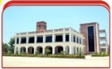
We nature happy and lifelong learners...