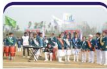
School Built On The Foundation Of Love & Care School