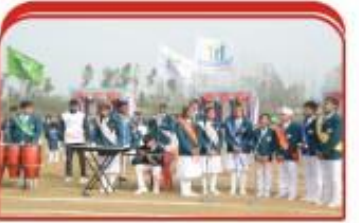
School built on the foundation Of Love & Care