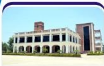
We Nurture Happy and Lifelong Learners